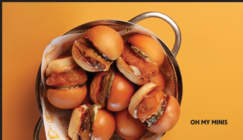
OH MY MINIS

6 pcs buffalo wings, 3 pcs cheesy sticks, 3 pcs chicken tenders, loopy fries, 3 slices cheesy garlic bread, 4 pcs onion rings, served with our in-house thousand island and honey mustard dip